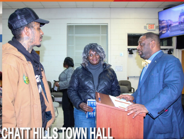
CHATT HILLS TOWN HALL