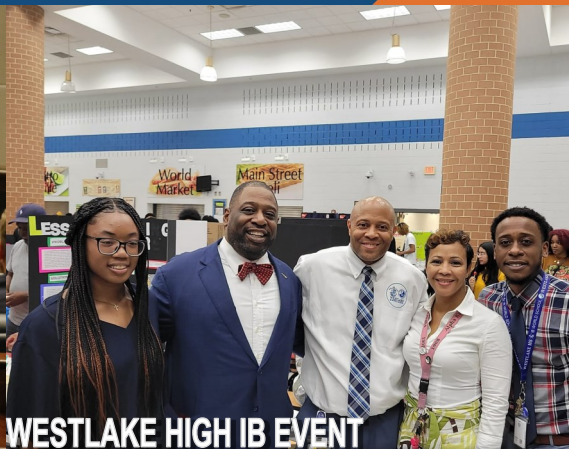
WESTLAKE HIGH IB EVENT